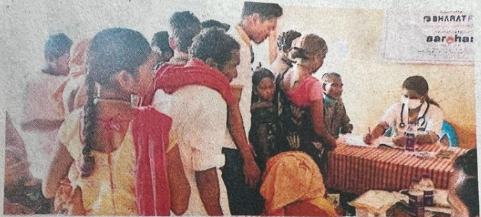
శిబిరంలో వైద్య సేవల కోసం క్యూలో ఉన్న గిరిజనులు