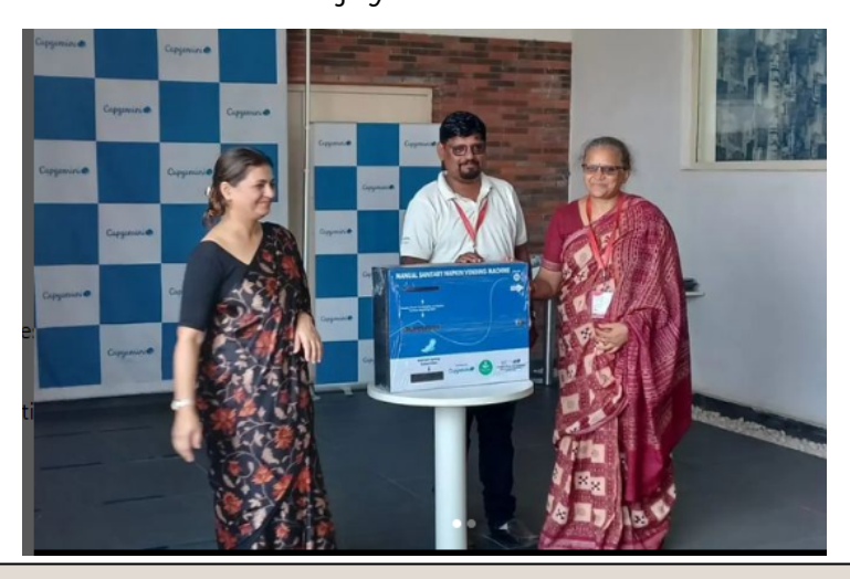
Donor Visit Visit conducted by team Avery Dennison at The Centre for Excellence Nebru

Thanks to the generous support of Capgemini India and Aide Et Action, we successfully set up vending machines for sanitary pads and water purifiers in our Gurugram and Noida communities. This initiative ensures easy access to hygiene products for girls and provides clean, safe drinking water for everyone. The program took place at the Capgemini Office and concluded with a joyful folk dance.