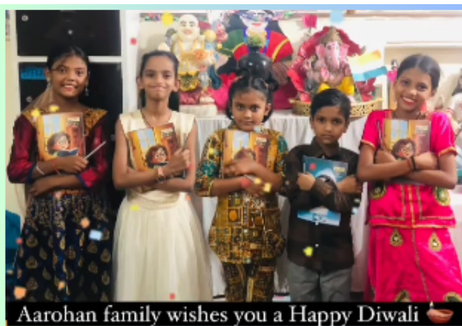
Aarohan family wishes you a Happy Diwali

All the festivals are celebrated at Aarohan to inculcate the value of our culture and religion to the children. Diwali with great enthusiasm and joy at all the centres of Aarohan including Noida, Gurugram and tribal schools. The students on this occasion sweets, cloths stationary and many more items were distributed to the children.